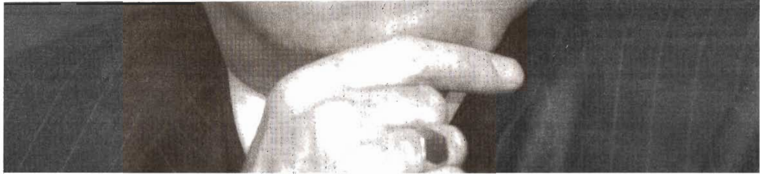
PERSONAL DIFFICULTIES: Jim McDaid's constituency had much sympathy for him regarding his drink problem.

Some people who met him at the height of his political powers would relate a person who was affable, charming and witty. Others would describe him as offhand, arrogant and boorish.